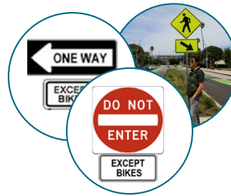
Bicycle and Pedestrian Signage