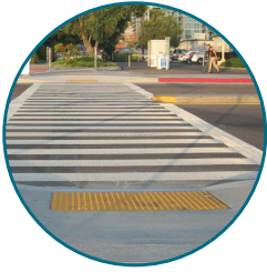
High-Visibility Ladder Crosswalks