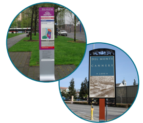
Gateway Elements and Way-Finding Signage