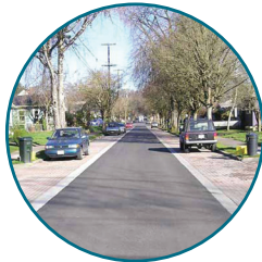
Permeable Pavers in Parking Lanes