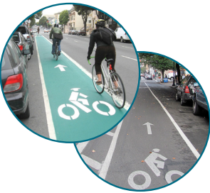
Bike Lane Striping