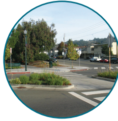
Pedestrian Refuge Islands