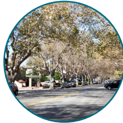
Additional Street Trees