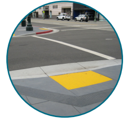
ADA Curb Ramp