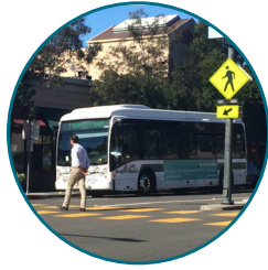
Rapid Flashing Beacons