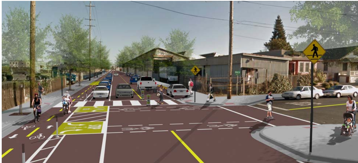
Figure 2: Two-way Bikeway on Estuary Side of Street