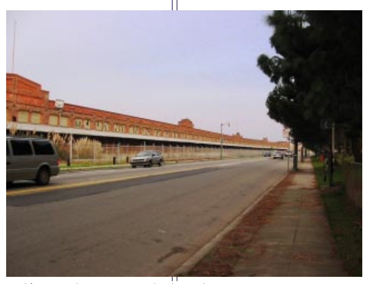
California Packing Company's brick warehouse