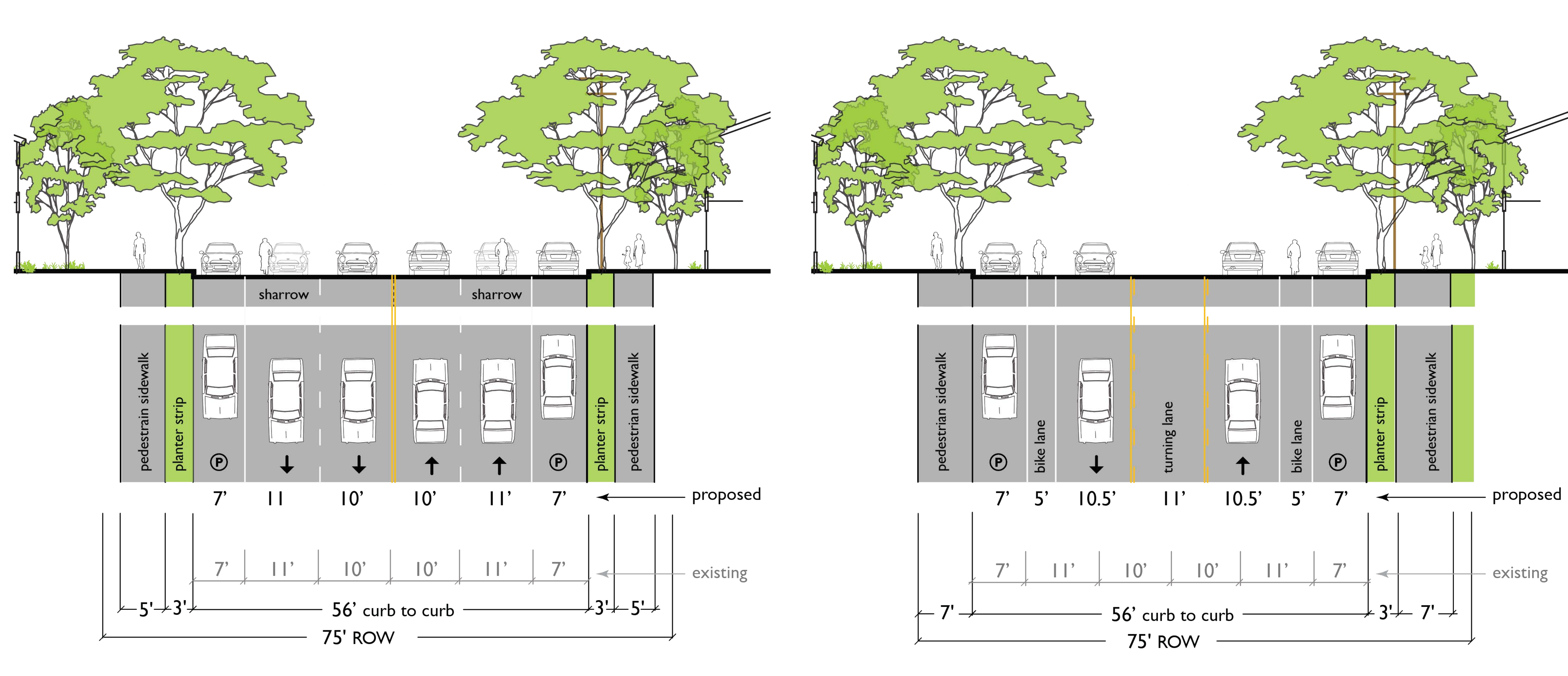
Webster and Eighth Intersections