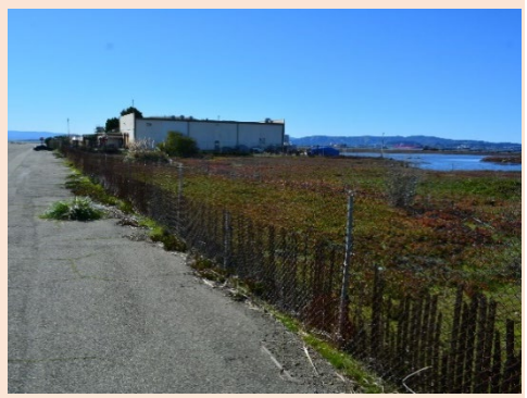
This former naval base in being remediated and provides opportunity to expand the existing wetlands.

Alameda Point can be used as a case study for how contaminated sites can be managed to account for the effects of sea level rise. Alameda Point is the former naval air station previously located on the western portion of Alameda. The naval base operated from 1940 until it was officially closed in 1997. During its operation, a number of industrial activities across the base resulted in residual contamination in soil and groundwater that continue to be addressed today. Contaminants in soil and groundwater include petroleum hydrocarbons, metals, chlorinated solvents, semi-volatile organic compounds, and radiological isotopes. The U.S. Navy is required to complete remedial activities under the oversight of the U.S. EPA as well as the DTSC and the RWQCB. Remedial technologies implemented at Alameda Point generally include the following: