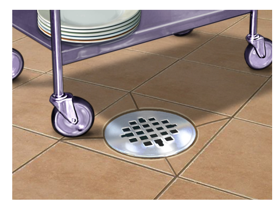
Sanitary Sewer Drain: An indoor drain that flows to the Sewage Treatment Plant.