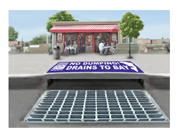
Storm Drain: An outdoor drain that flows directly to creeks and the Bay.

If you are not certain whether a drain leads to the storm drain or sanitary sewer, call your local stormwater agency for assistance.